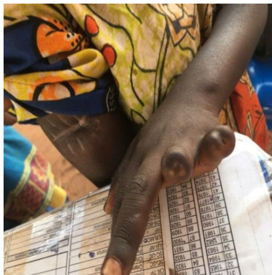
Child from the village of Cinq whose fingers were chopped off by machete by a local leader on 24 April 2017

45. The team interviewed a mother with her seven-year old son who had been caught by a traditional leader in Cinq as he was trying to escape from the village on 24 April. The local leader chopped some of his fingers off (see photo below) while other attackers sliced open his face and arm. The face of the boy was totally disfigured.