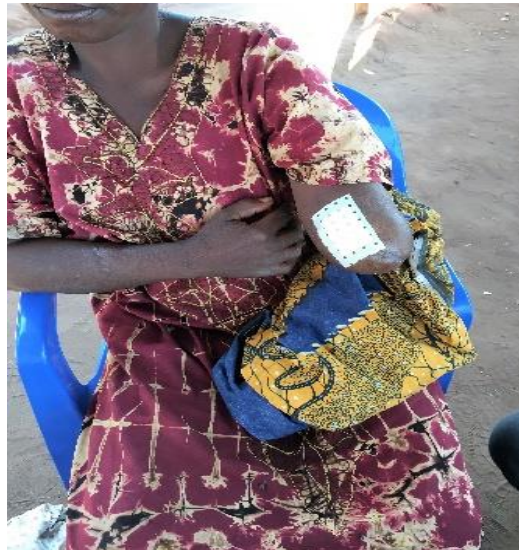
A female survivor of the attack on Cinq by the Bana Mura militia on 24 April. She had her arm amputated in an Angolan hospital after she fled the DRC

46. Another survivor interviewed was hiding in her home in Cinq on 24 April when militia elements entered and attacked her with a machete. Her left arm was sliced off (see Photo below). She was able to flee despite her wound, hid in the forest for several days before reaching the Angolan border, and was airlifted by an Angolan Government helicopter to the hospital in Dundo.