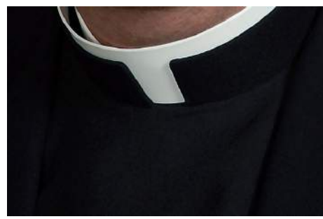
Australian bishop affirms innocence amid charges of concealing abuse