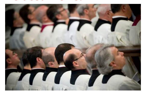
Confirmed priest abuse allegations in single digits for 2014