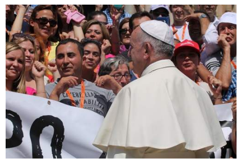
Pope Francis off-the-cuff to young people: Don't waste your lives