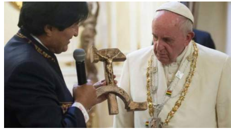
Pope Francis apparently not amused by 'communist crucifix' (Updated)