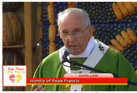
Want to preach the Gospel effectively? Be welcoming, Pope says