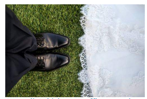
Australia's bishops reaffirm marriage – and get reported to government