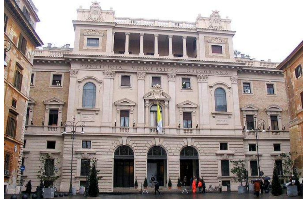
The Pontifical Gregorian University in Rome, which will offer a diploma course in minor protection in 2016.